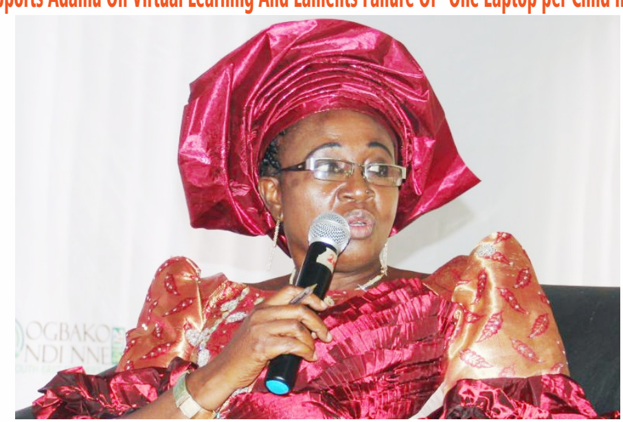
Mrs. Chinwe Nora Obaji, Former Minister of Education.

...Supports Adamu On Virtual Learning And Laments Failure Of "One Laptop per Child Initiative".